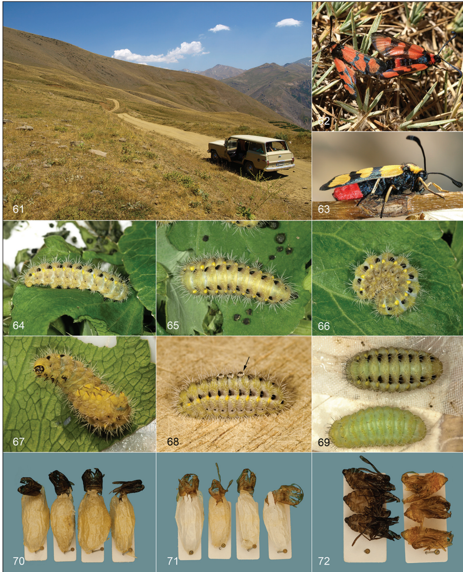
Figs 61–72. Zygaena tamara and Z. tamara dailamica ssp. n., habitats, bionomics. 61. Treeless, high-mountain steppe habitat above Tamol (13.vii. 2010), dominated by cushions, thorny and spiny vegetation and grasses. 62. Copula of Z. tamara dailamica ssp. n. on Acantholimon cushion (Plumbaginaceae) (Gardaneh-ye Tondrokosh, 13.vii.2010); note the single red abdominal cingulum. 63. Zygaena tamara mahabadica , e.o., e.p. 29.v.2009; note the red abdominal cingulum over three segments. 64–68. Final instar larva (lateral, dorsal, ventral views) of Z. tamara dailamica ssp. n. (1.–12.V.2009, Gardaneh-ye Ambarkesh). 69. Comparison of fully-grown larvae of Z. tamara dailamica ssp. n. (above) from type-locality and Z. tamara mahabadica (Iran, Kurdistan, Baneh vic.) (below). 70. Cocoons with exuviae of Z. tamara dailamica ssp. n. 71. Cocoons with exuviae of Z. tamara mahabadica (Iran, Kurdistan, Baneh vic.). 72. Comparison of exuviae of Z. tamara dailamica ssp. n. (dark brown) from type-locality and Z. tamara mahabadica (Iran, Kurdistan, Baneh vic.) (light brown).