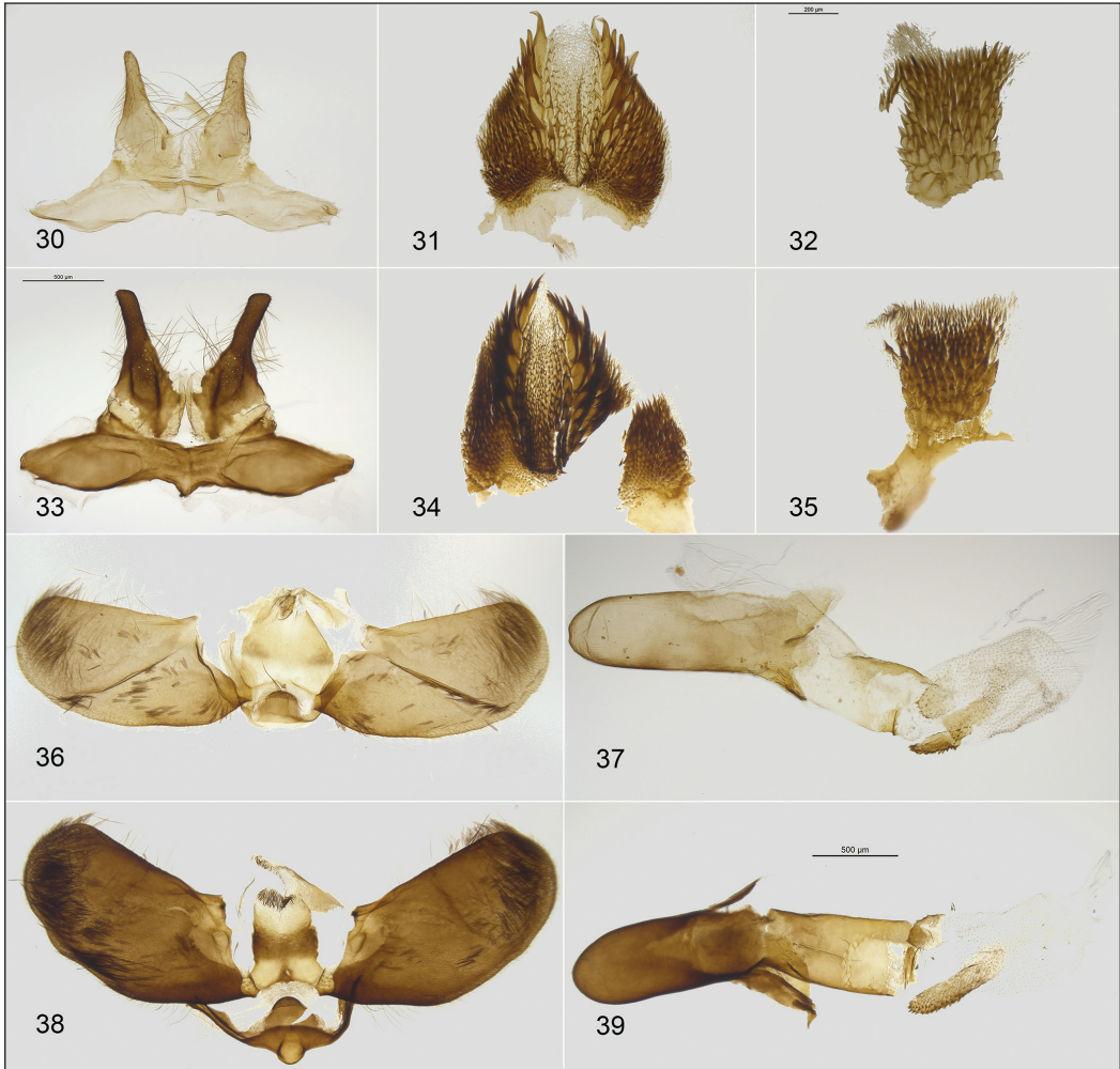
Figs 30–39. Diagnostic characters of male genitalia of Zygaena speciosa speciosa (30–32, 36, 37) and Z. speciosa oseyii ssp. n. (33–35, 38, 39). 30, 33. Uncus-tegumen complex. 31, 34. Lamina dorsalis. 32, 35. Lamina ventralis. 36, 38. Valva with vinculum and saccus. 37, 39. Phallus (Aedoeagus sensu Alberti, 1958) with cornuti.

anal vein. Spot 6 is either strongly reduced or predominantly completely missing in Z. speciosa speciosa , while it is predominantly present or at least vestigial in Z. speciosa oseyii ssp. n. Not a single specimen from all of these three new localities can be confused with specimens from Alam Kuh, Dizin-Shemshak or from Kuh-e Tochal, nor can any single specimen from these localities be incorporated into the series of oseyii ssp. n. The localities of the most easterly population of oseyii ssp. n. (Kuh-e Khash-Chal) and Z. speciosa speciosa are less than 40 km from each other as the crow flies and, surprisingly, the population nearest to the Alam-Kuh population even exhibits the most reddish forms of all three known populations.