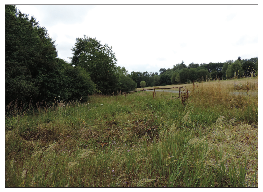
Figure 3. The locality near Josefov, Eastern Bohemia, where the caterpillar of Phengaris nausithous was found in a nest of Myrmica scabrinodis .

found that P. nausithous juveniles died in nests of non-host Myrmica ants within one month of adoption. Thus we suggest that it is legitimate to consider M. scabrinodis as a true host of this caterpillar.