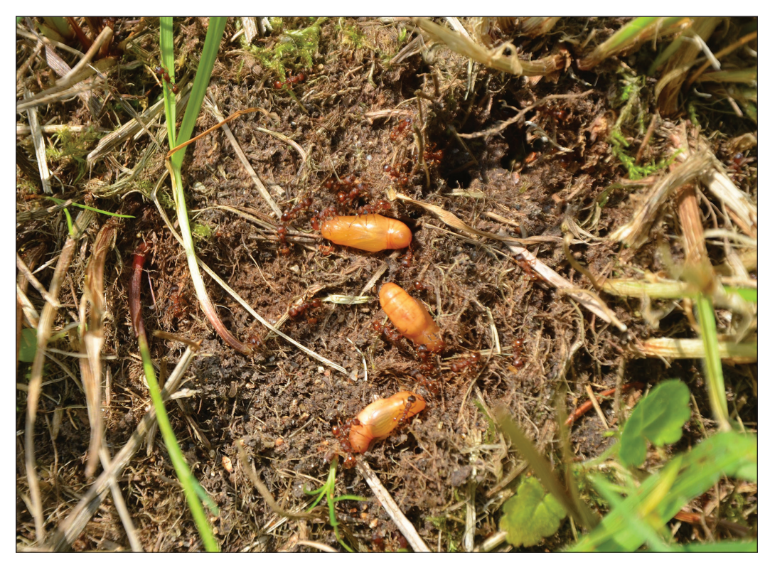
Figure 2. Pupae of P. alcon in a M. scabrinodis nest. Locality Placy near Příbram in Central Bohemia, 1 July 2015.

( Lasius niger (Linnaeus, 1758), L. platythorax Seifert, 1991, L. flavus (Fabricius, 1782), Formica fusca Linnaeus, 1758 and F. polyctena Förster, 1850) were opened in Mečichov in 2000–2001. We found many nests of M. scabrinodis infested by P. alcon , but no other ants hosting these caterpillars at this locality. Unfortunatelly, the presence of caterpillars in ant nests was not recorded precisely to allow quantitative analysis, but the observations correspond to the published data, because M. scabrinodis is the most common host of P. alcon in central Europe, although P. alcon is able to develop in the nests of many Myrmica ants (Pech et al. 2007; Witek et al. 2008; Sielezniew and Stankiewicz-Fiedurek 2009; Sielezniew et al. 2015).