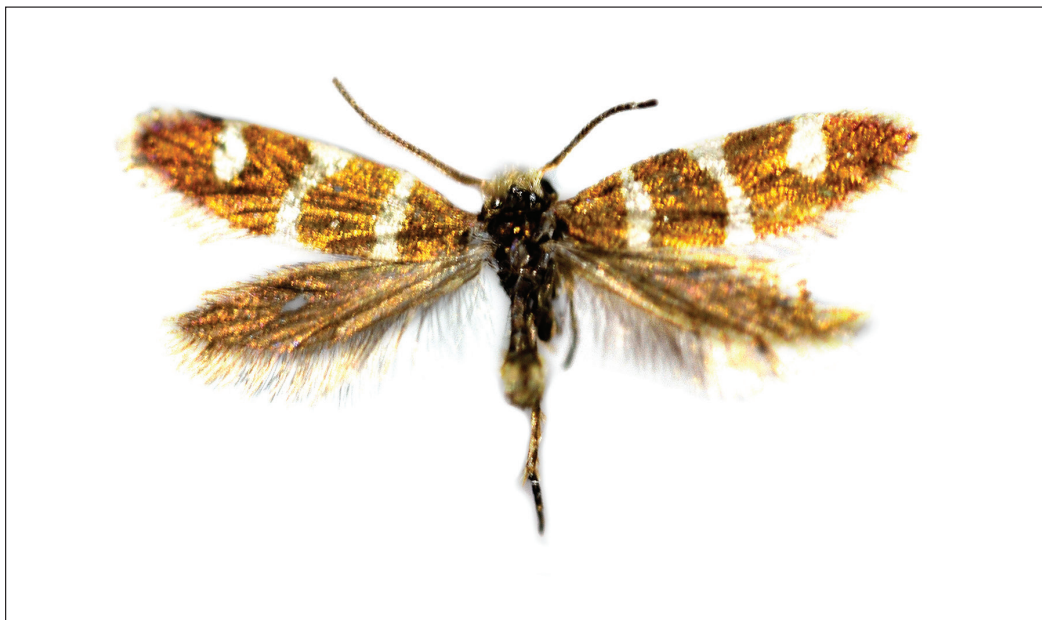
Figure 1. Male holotype of M. jabalmoussae sp. n.

1062 and red label “HOLOTYPE of Micropterix jabalmoussae Zeller, Kullberg & Kurz”. – Paratype: 1 ♀, same data as holotype but http://id.luomus.fi/GK.6675 , label with identification numbers CZ-Z27208 and red label “PARATYPE of Micropterix jabalmoussae Zeller, Kullberg & Kurz.”