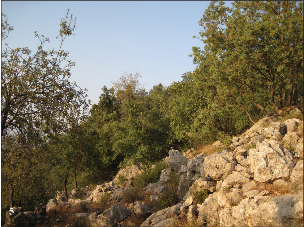
Figures 4–5. Type locality of M. jabalmoussae sp. n..