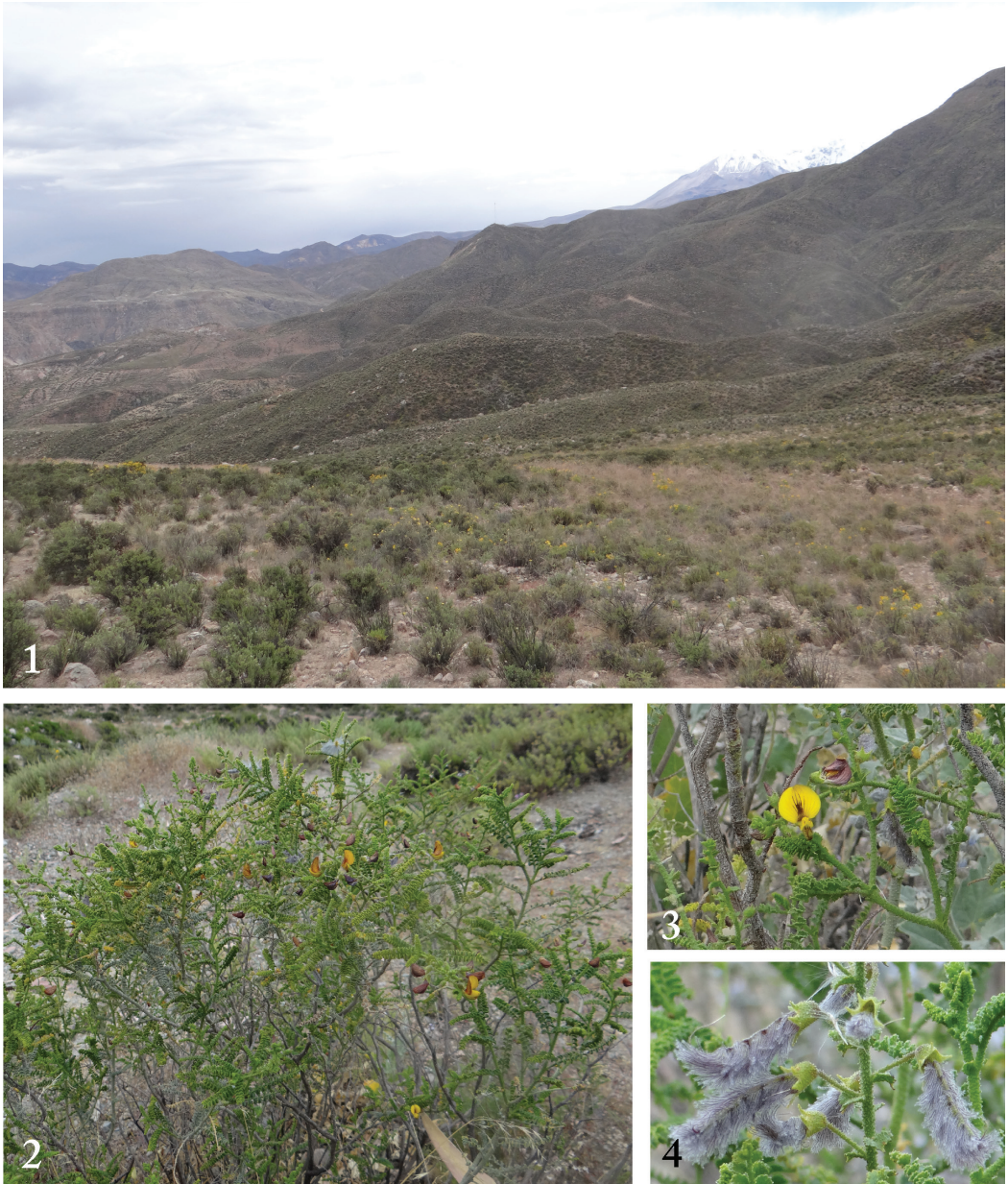
Figures 1–4. Habitat and host plant of Ypsolopha moltenii in the type locality. 1. Habitat of Y. moltenii close the Socoroma village, Arica Province, northern Chile, at about 3200 m elevation on the western slopes of the Andes. 2. A shrub of Adesmia verrucosa , the host plant of Y. moltenii . 3. Detail of a flower of A. verrucosa . 4. Fruits of A. verrucosa .

larvae were placed in plastic vials and brought to the laboratory. Additional inflorescences were provided periodically until larvae finished feeding and pupated. Adults were mounted and their abdomens were dissected following standard procedures. The genitalia were stained with Eosin