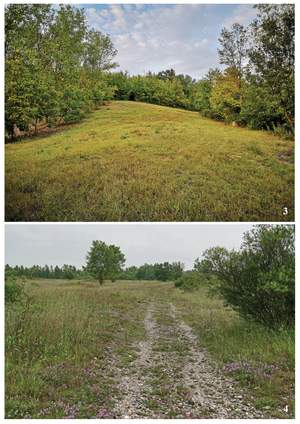
Figures 3, 4. Collecting sites of Cosmopterix feminella in Italy. 3. Asti, Cascine Bet. Photo G. Baldizzone; 4. Udine, Medeuzza, Confl. Torrente Torre-Natisone. Photo H. Deutsch.