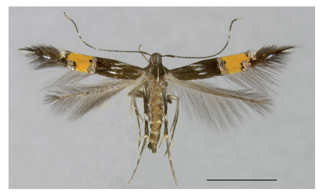
Figure 1. Cosmopterix feminella, female habitus, Asti, Cascine Bet, 12.vi.2016, RMNH.INS.15509. Scale bar: 2 mm.

Biology. The biology has been described by Kuroko (2015) (as C. feminae ), from which we cite the following. Host plants: Digitaria ciliaris (Retz.) Koeler and D. violascens Link (Poace-ae). Larva (last instar): head blackish brown, body cylindrical, pale yellow, prothoracic shield and anal plate black, prothoracic legs blackish brown. The larva mines the leaves and makes an irregular blotch mine from near the base towards the apex of the leaf. The frass is ejected from a hole at the beginning of the mine. The larva changes leaves to make more than one mine. Pupation takes place outside the mine in a spindle-shaped whitish brown cocoon in a folded space on a leaf. In Japan (Kyushu: Mt. Hikosan) up to four generations per year occur. The larva of the last generation hibernates full grown and pupates in the middle of May the following year. The adults are on the wing in late May, in late July, from mid-August to mid-September and in late October. The European specimens of C. feminella were collected in the months June, August, September and October.