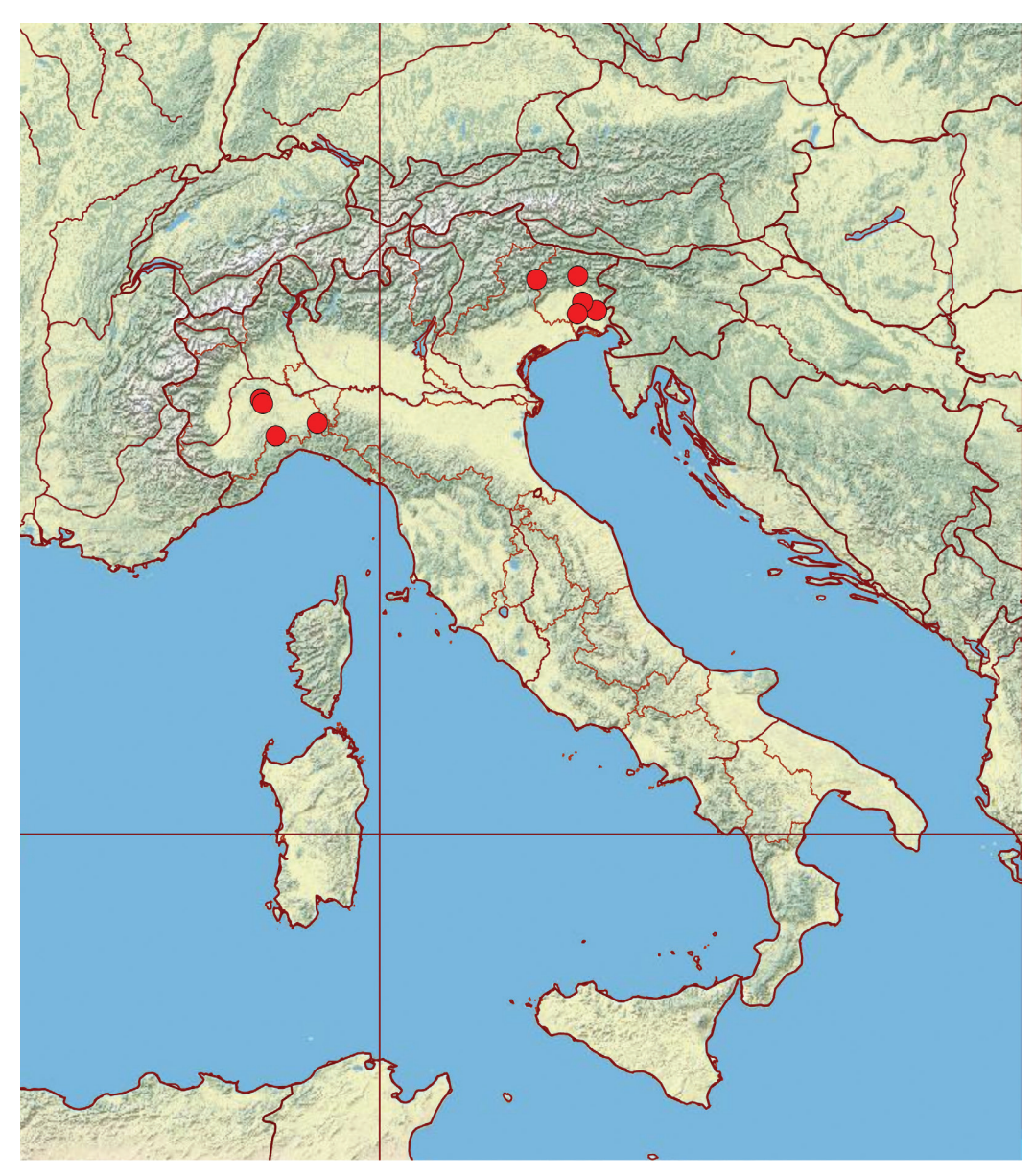
Figure 5. Map of collecting localities of Cosmopterix feminella in Italy.

also only females were known. His conclusion was that the Japanese species shows sufficient differences to describe it as a new species, based on the following features: the apical segment of the antenna is black in C. feminae ; but white in C. feminella ; in the forewing the subcostal line starts from the base of the wing in C. feminae , which is not the case in C. feminella ; in the female genitalia the sterigma (lamella antevaginalis) lacks the tongue-shaped extension at the top as seen in C. feminella ; the ductus bursae is about half the length of the corpus bursae in C. feminae instead of nearly the same length in C. feminella .