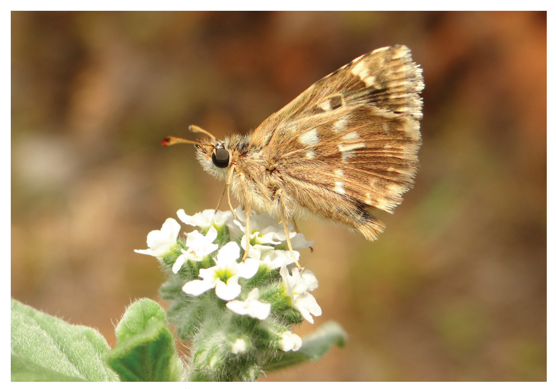
Figure 3. Muschampia proto from Šumet near Golubov kamen.