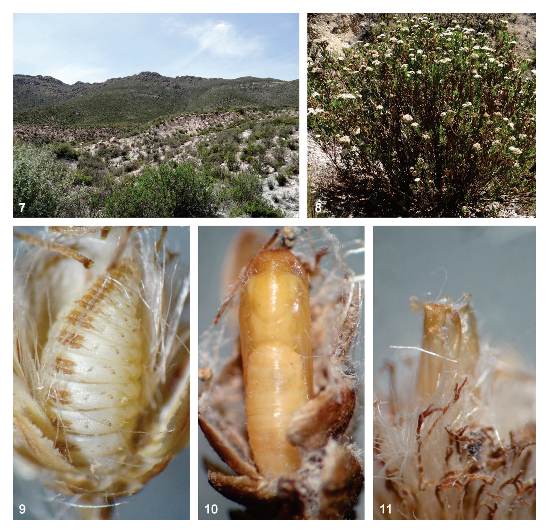
Figures 7–11. Natural history of Adaina jobimi sp. nov. 7. Habitat at the type locality. 8. The host plant, Baccharis alnifolia (Asteraceae). 9. Larva shortly before pupation. 10. Dorsal view of pupa. 11. Lateral view of pupal exuvium.