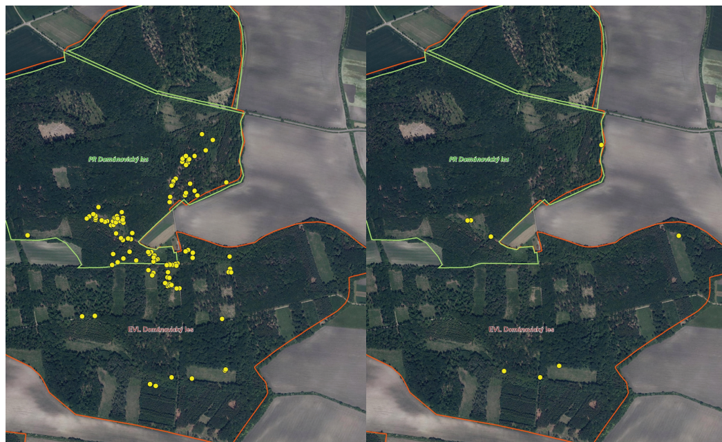
Figure 2. Examples of the GPS-recorded positions of Euphydryas maturna larval nests (yellow dots), showed for 2018, year with still rather high nests numbers, and 2020, year with the lowest count ever. Thin green line is the border of Dománovický les nature reserve [= PR], green, thin red line is the border of the Dománovický les Site of community interest [= EVL]. The nests are visibly concentrated in the centre of the occupied area in 2018, while proportionally more nests occur in peripheral positions in 2020.

found in marginal positions. Threats acting as contagions, including natural enemies or diseases, affect populations from centroids of their distributions towards peripheries, while the peripheries are more likely spared (Channel and Lomolino 2020). A complementary explanation for this spatial pattern may follow from biology of the natural enemies, for which it may be more difficult to locate peripherally situated hosts. For the butterfly, a trade-off may exist between development in a half-shaded mature forest, likely suboptimal microclimatically (Freese et al. 2006) but less exposed to natural enemies, and development at microclimatically suitable but infestation-exposed clearings (cf. Rothman and Roland 1998). Finally, a cyclical variation of the host plant chemical defences, complementary with fluctuations of parasitoids and known to affect, e.g., defoliating geometrid moths (Ossipov et al. 2014), may warrant investigation.