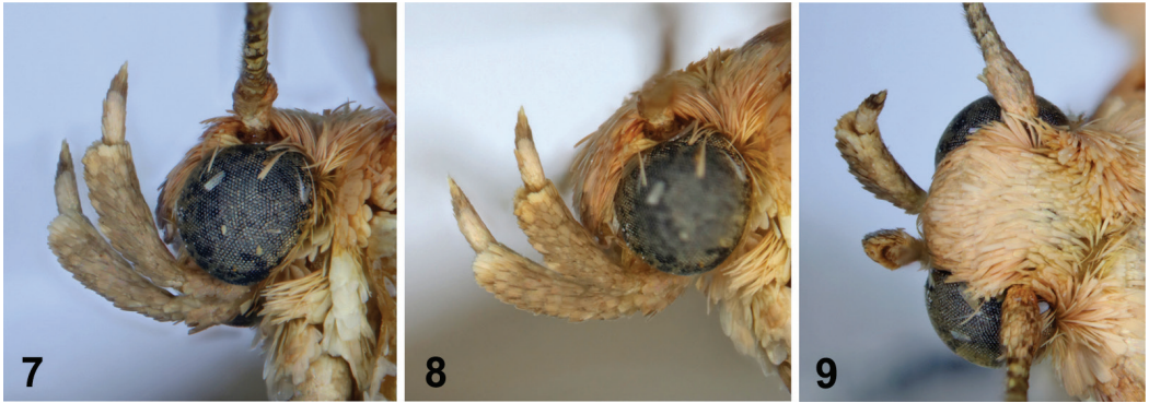
Figures 7–9. Metanarsia moroccana sp. nov., head; 7, 8. Lateral view; 9. Dorsal view; 7. Holotype; 8, 9. Paratypes.